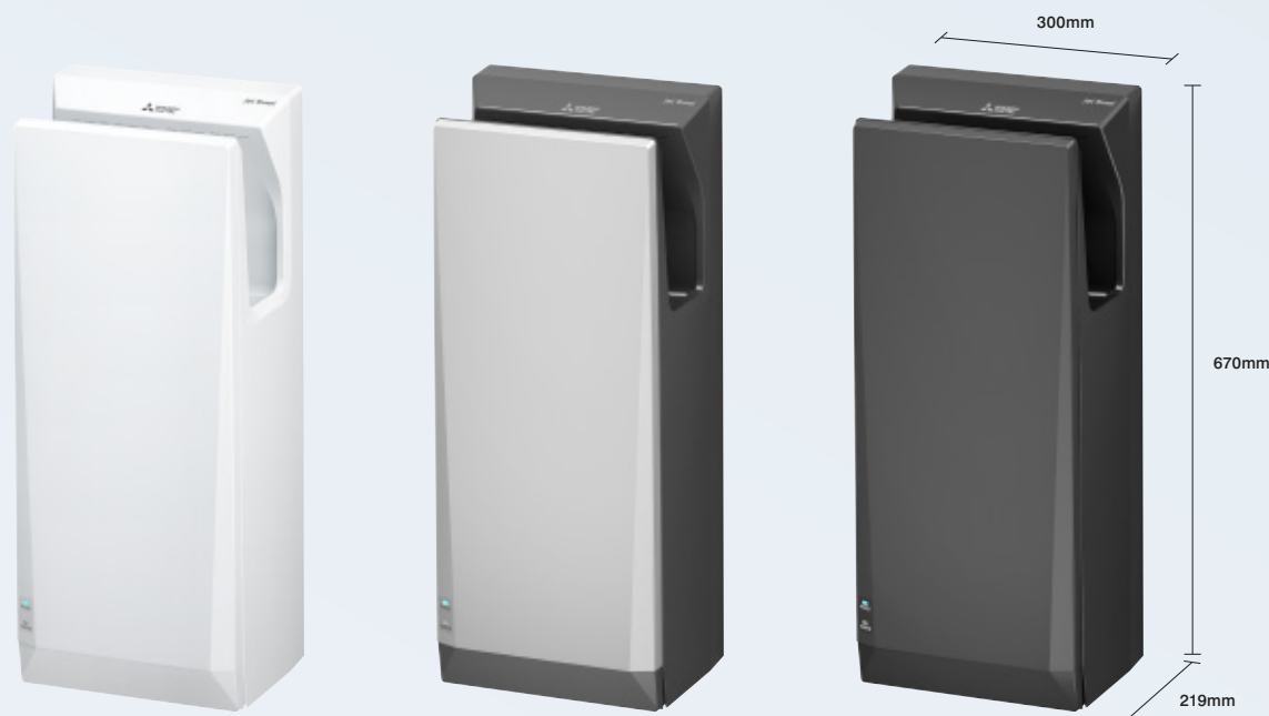
JT-SB216JSH2-W JT-SB216KSN2-W (Unheated) White

The market leader of hands-in dryers for its ability to combine low energy, fast drying and ultra quiet performance.